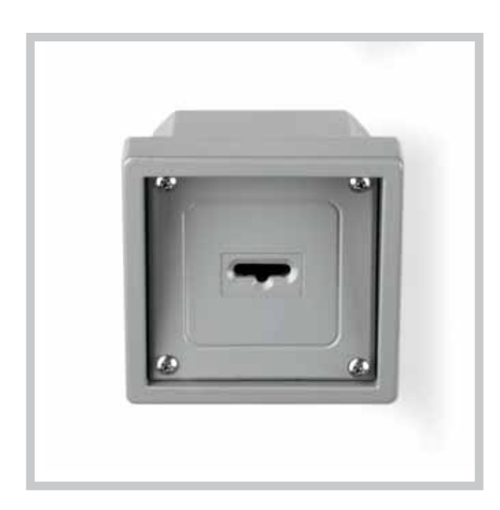
ID.SCM Magnetic key selector