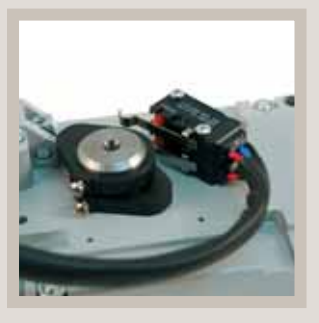
Electromechanical opening and closing limit switches included