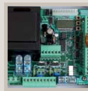
Suggested control panel: BRAINY/BRAINY24