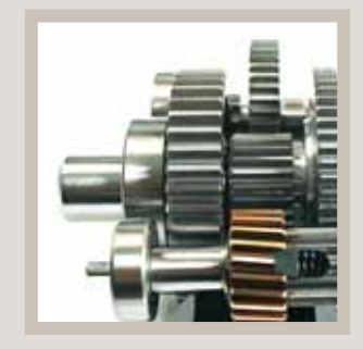
Reduction unit made of steel for a long life of the product